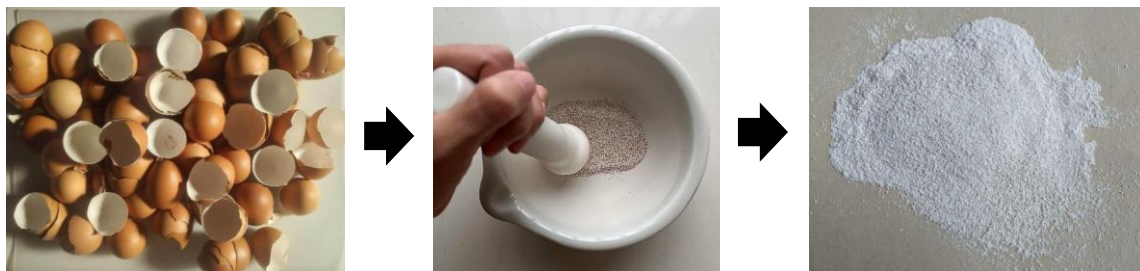
Figure 2. Preparation process of ESP

Based on its chemical composition (Table 1), ESP exhibits notable pozzolanic characteristics and can be classified as a Class F pozzolan according to ASTM standards (Afolayan, 2017). This classification underscores its potential suitability as a partial replacement for conventional calcium carbonate or cementitious components in building materials, particularly within sustainability-oriented construction practices.