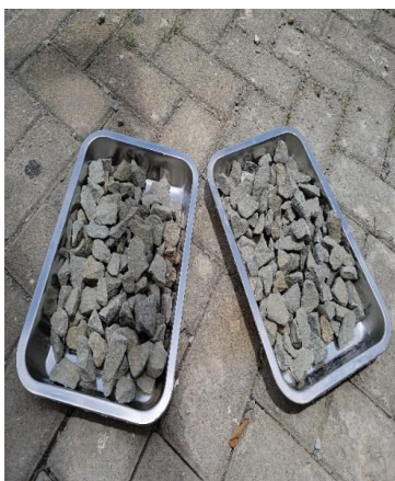
Fig. 2 Coarse aggregate