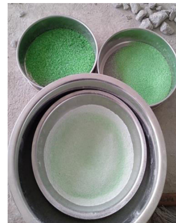
Fig. 4 Glass powder