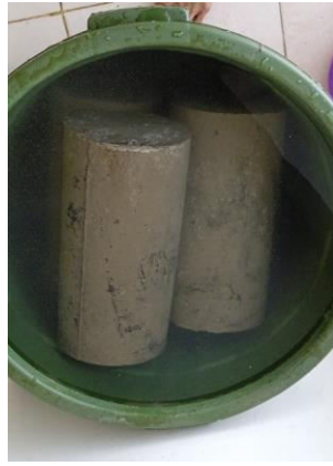
Fig. 6 Water curing