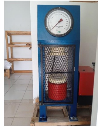
Fig. 7 Compressive strength test