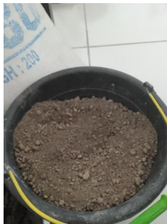
Fig. 3 Fine aggregate