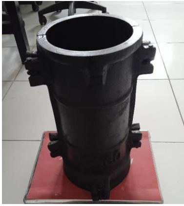
Fig. 5 Cylindrical mould, size of 150 mm × 300 mm