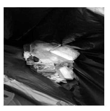
Fig 1. Waste in President University

The waste collection system at President University using one dustbin placed in front of the building, classroom, lecture room, and toilet (Figure 2). If it is adjusted based on SNI 19-2454-2002 about "Tata Cara Teknik Operasional Pengelolaan Sampah Perkotaan," waste storage here is still not following the type of waste that is disaggregated, such as organic waste, inorganic waste, and hazardous toxic waste. The waste collection system at President University collected through the door to door service and disposed-off behind the campus by cleaning service (Figure 3).