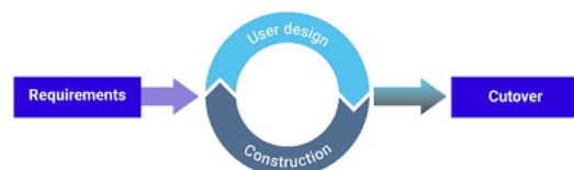
Figure 1. Rapid Application Development (RAD) Flow

This thesis used the RAD (Rapid Application Development) method. In the RAD model, functional modules are developed in parallel as prototypes and integrated to create complete products for faster product delivery. RAD consists of 4 stages which will be explained as follows: