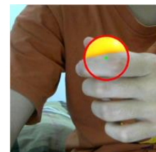
Figure 5: Circle Hough Detection

Circle Boundary is an algorithm to detect circle object and optimize it although the captured object is not in 100% circle because of some noises. The algorithm will calculate and extract the full data of circle such as in Figure 5. There are some part of ball hidden by hand when user hold the yellow ball, however the program using circle boundary recognition will extract the feature and get optimized result (red circle) which can be seen in Figure 5.