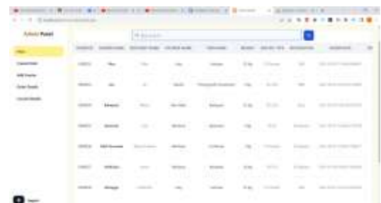
Figure 5. Order Detail