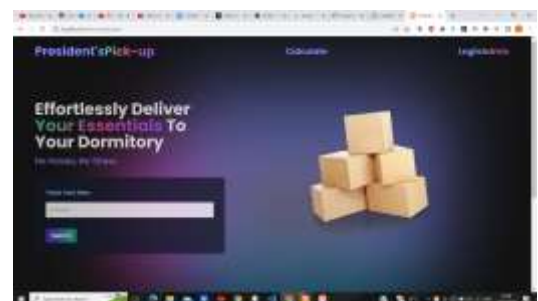
Figure 6. User Dashboard