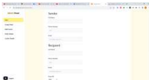
Figure 2. Sender and Recipient Form