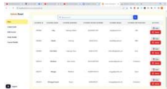
Figure 4. Courier Detail