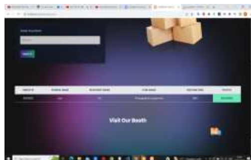
Figure 9. Tracking Page in User Dashboard