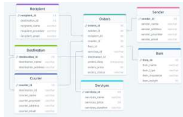
Figure 1. Entity Relationship Diagram

Based on Figure 1, we can see that the "order" table is the central table that has many relationships with other entities in this database program. The entities in the "order" table that are related to entities in other tables include sender_id, recipient_id, courier_id, service_id, item_id, and destination_id.