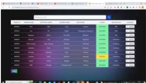
Figure 10. Courier Dashboard