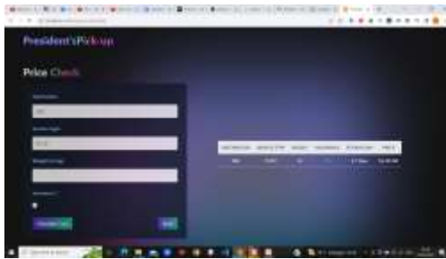
Figure 8. Price Check Page