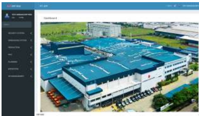
Figure 5. 2 User Interface of Dashboard Page