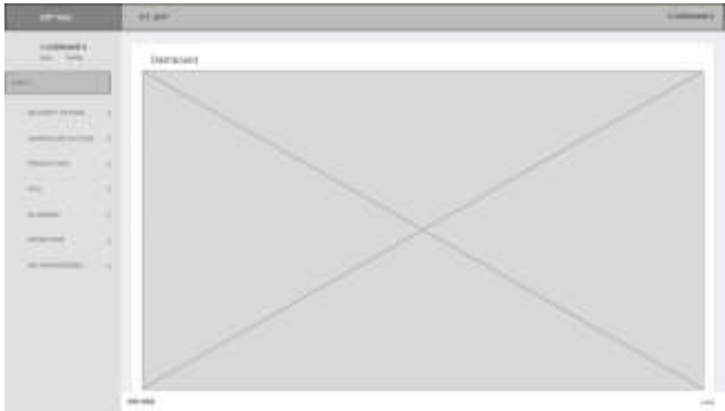
Figure 4. 2 User Interface of Dashboard Page