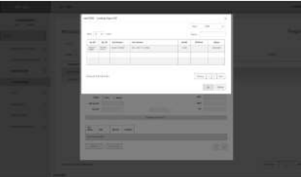
Figure 4. 5 User Interface of Lookup Input OC