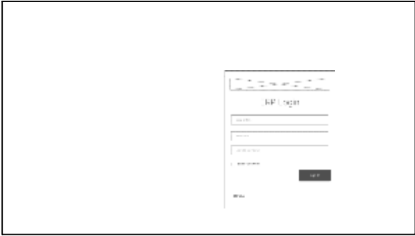
Figure 4. 1 User Interface of Login Page

System Design is a stage that describes how a system will be formed. This stage is one of the important stages in system development because it is the basis that represents the business logic of the software.