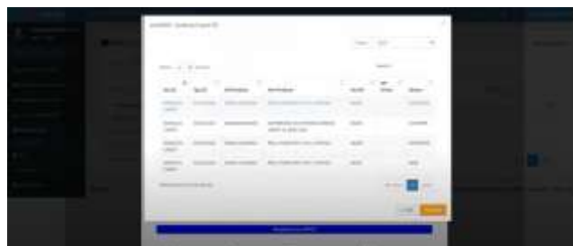
Figure 5. 5 User Interface of Lookup Input Order ConfirmationMenu Page