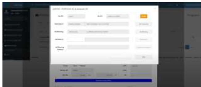
Figure 5. 7 User Interface of Confirm OC & Generate Work OrderSub Menu Page