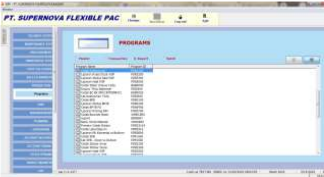
Figure 2. 1 ERP desktop-based

Figure 2.1 is a screenshot of the desktop-based ERP system of PT. SFP