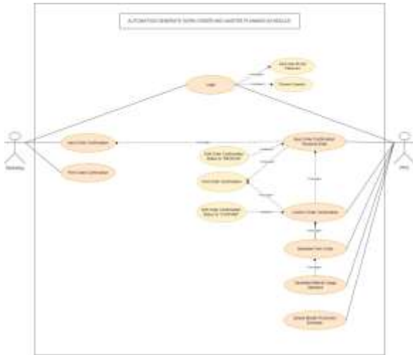
Figure 3. 1 Use Case Diagram

System Design is a stage that describes how a system will be formed. This stage is one of the important stages in system development because it is the basis that represents the business logic of the software.