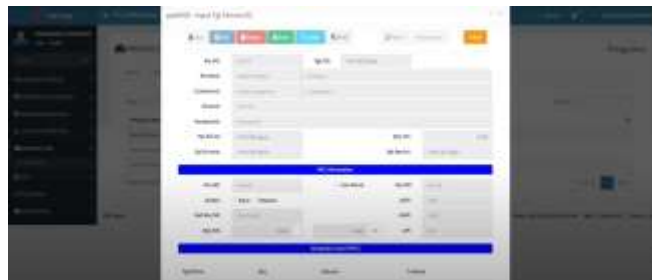
Figure 5. 4 User Interface of Input Order Confirmation (OC)Receipt Menu Page