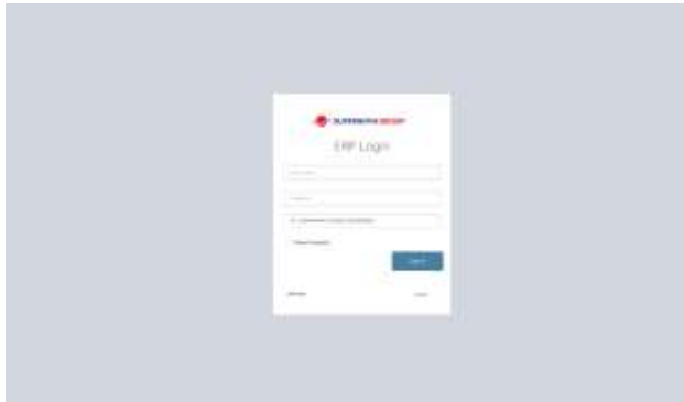
Figure 5. 1 User Interface of Login Page