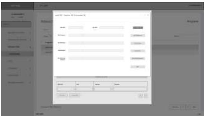
Figure 4. 7 User Interface of Confirm OC & Generate Work Order - Sub Menu