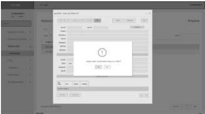
Figure 4. 6 User Interface of Reset OC Data to NEW