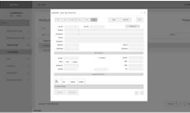
Figure 4. 4 User Interface of Input OC Receipt Date Menu