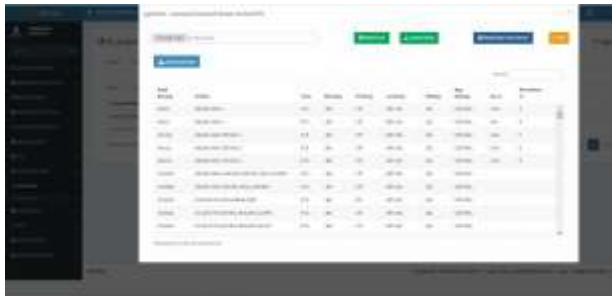
Figure 5. 7 User Interface of Upload/Download MPS Menu Page