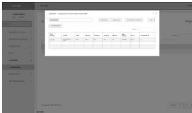
Figure 4. 7 User Interface of Upload/Download MPS Menu