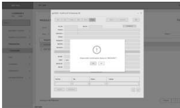
Figure 4. 7 User Interface of Reset OC Data to RECEIVED