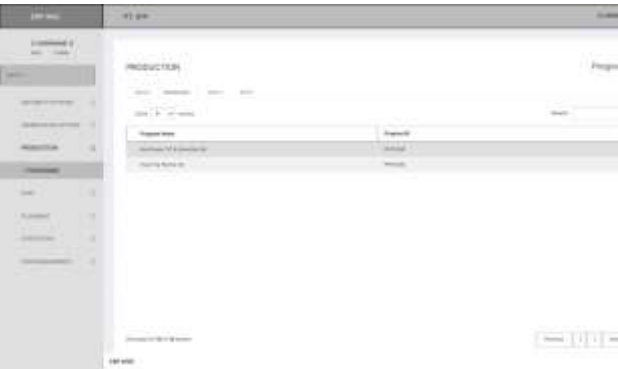
Figure 4. 3 User Interface of Production Module Page