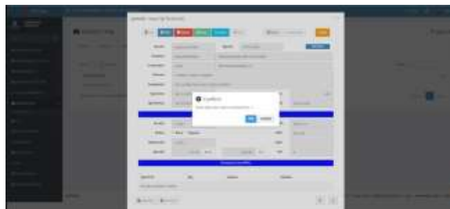
Figure 5. 6 User Interface of Reset Order OC Data Notification