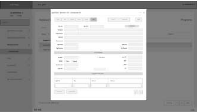
Figure 4. 7 User Interface of Confirm OC & Generate Work Order