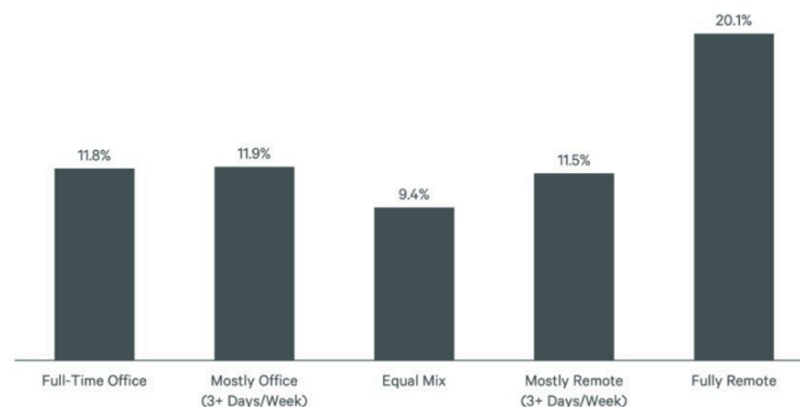
Figure 1. US Office Attendance Policy Trends Q3 2023

Recent data highlights the challenges associated with remote work and its implications for employee turnover. According to the "U.S. Office Attendance Policy Trends Q3 2023" study (Figure 1), which analysed data from 278 U.S. companies across various industries, fully remote companies experience significantly higher turnover rates compared to them in-person or hybrid counterparts. The study found that fully remote organizations reported an average turnover rate of 20.1%, while companies with hybrid or in-office models had lower turnover rates, ranging from 9.4% to 11.9% (U.S. Office Attendance Policy Trends Q3 2023, 2023). These figures underscore the need for organizations to develop effective strategies to retain remote employees and minimize turnover.