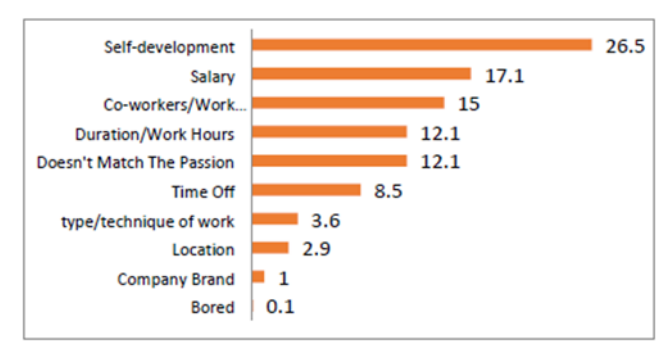
Figure 1. Millennial Moving Consideration Factor

Thus, to determine what factors most influence turnover intention, the researcher also interviews seven millennial employees who were randomly selected, born in 1980-2000, worked in Central Jakarta, and has a different company and length of work. The pre-survey interview results conclude the three factors that influence employees to leave are Career Development which was chosen by 5 respondents, Compensation chosen by four respondents, and Work Environment with chosen by 5 out of 7 respondents that influence them to resign. The pre-survey interview is also in line with the results of research from IDN Time, which surveyed 12 cities in Indonesia, one of which includes Jakarta shows that the three highest factors that underlie millennial generation considerations for leaving the job or companies are the factors of facilities or self-development, salaries, and friends or work environment that can be seen in Figure 1 below.