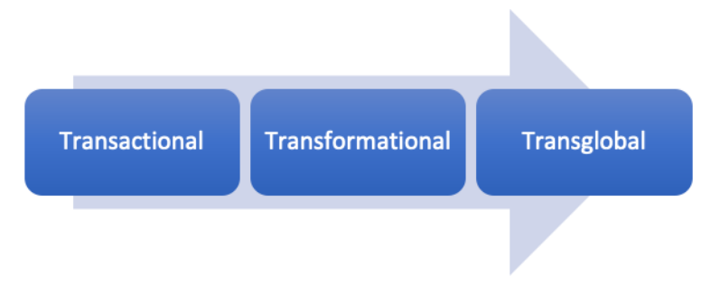
Figure 1. Evolution of Leadership Theory

transactional angle and transformational leadership between leaders and followers has not looked at global interests. Therefore, the concept of Transglobal leadership emerged which was initiated by Sharkey et al. (2012). Figure 6. shows the evolution of leadership theory described by Sharkey et al. (2012). All of these leadership models are processed and developed in the Western context, testing their suitability in the Asian context needs to be explored (Bush et al., 2018). This paper will examine the concept of Transglobal leadership in the palm oil industry sector in Indonesia.