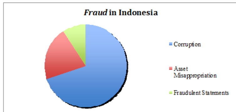
Figure 1. Fraud in Indonesia

the Association of Certified Fraud Examiners (ACFE) in the Indonesia Fraud Survey (2019), it is known that the most common type of fraud committed by agencies in Indonesia is corruption, with the government being the most disadvantaged. The following is a graph of fraud in Indonesia.