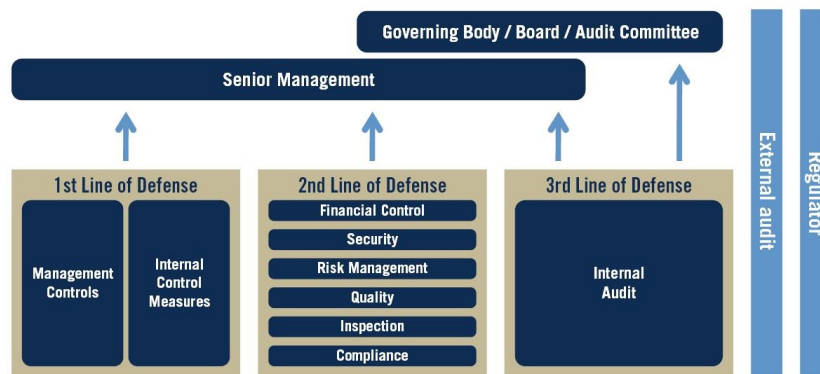
Figure 3. Three Lines of Defense