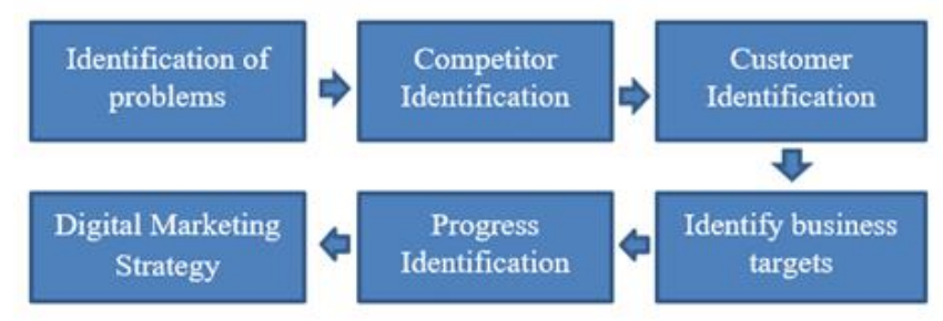
Figure 1. Stages of Determining a Digital Marketing Strategy (Ryan, 2014)

The research method used is descriptive research, which is a research method aimed at describing existing phenomena that are taking place today. Descriptive research aims to create a systematic, factual and accurate description of the facts and characteristics of a particular research object. Based on the analysis of the two characteristics above, it can be decided to implement a digital marketing strategy with the stages of determining the best strategy and the first step in laying digital foundations in the form of identification of businesses, competitors, customers, business targets, and progress (Ryan, 2014).