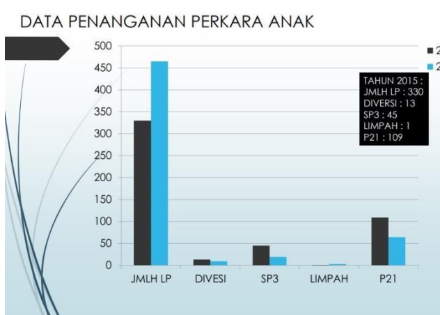
Picture 2. Child-Case Settlement in West Java