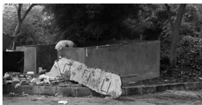
Fig 3 Temporary Waste Collection

Table 1 shows a summary of the existing conditions of waste collecting, segregation, and handling of waste at President University.