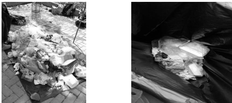
Fig 1. Waste in President University

The waste collection system at President University using one dustbin placed in front of the building, classroom, lecture room, and toilet (Figure 2). If it is adjusted based on SNI 19-2454-2002 about " Tata Cara Teknik Operasional Pengelolaan Sampah Perkotaan, " waste storage here is still not following the type of waste that is disaggregated, such as organic waste, inorganic waste, and hazardous toxic waste. The waste collection system at President University collected through the door to door service and disposed-off behind the campus by cleaning service (Figure 3).