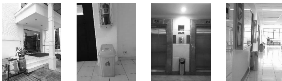
Fig 2 Waste Container for Collection in Campus

The waste collection system at President University using one dustbin placed in front of the building, classroom, lecture room, and toilet (Figure 2). If it is adjusted based on SNI 19-2454-2002 about " Tata Cara Teknik Operasional Pengelolaan Sampah Perkotaan, " waste storage here is still not following the type of waste that is disaggregated, such as organic waste, inorganic waste, and hazardous toxic waste. The waste collection system at President University collected through the door to door service and disposed-off behind the campus by cleaning service (Figure 3).