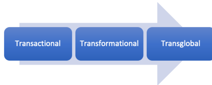
Figure 1. Evolution of Leadership Theory

transactional angle and transformational leadership between leaders and followers has not looked at global interests. Therefore, the concept of Transglobal leadership emerged which was initiated by Sharkey et al. (2012). Figure 6. shows the evolution of leadership theory described by Sharkey et al. (2012). All of these leadership models are processed and developed in the Western context, testing their suitability in the Asian context needs to be explored (Bush et al., 2018). This paper will examine the concept of Transglobal leadership in the palm oil industry sector in Indonesia.