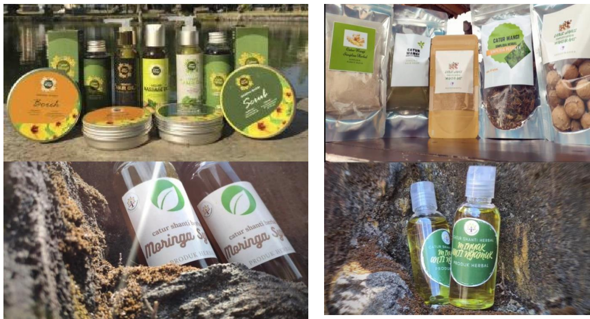
Figure 3. Catur Wangi & Catur Shanti Herbal Products

In terms of output of the production, the women already packaged and marketed online and offline under the brand “Catur Wangi” now include healing oil, massage oil, hair oil, facial oil, boreh (herbal body mask used for Balinese therapy), body scrub, and essential oils, and dried forms of simplicia . In addition, co-brand “Catur Shanti Herbal” was developed in 2020, with several spin-off products initiated by the women themselves. This has spurred the rise of green entrepreneurship among the women in the village. Additionally, the target group was assisted and trained in digital marketing, as the products are now marketed offline and online. Some of the products can be seen in Figure 3.