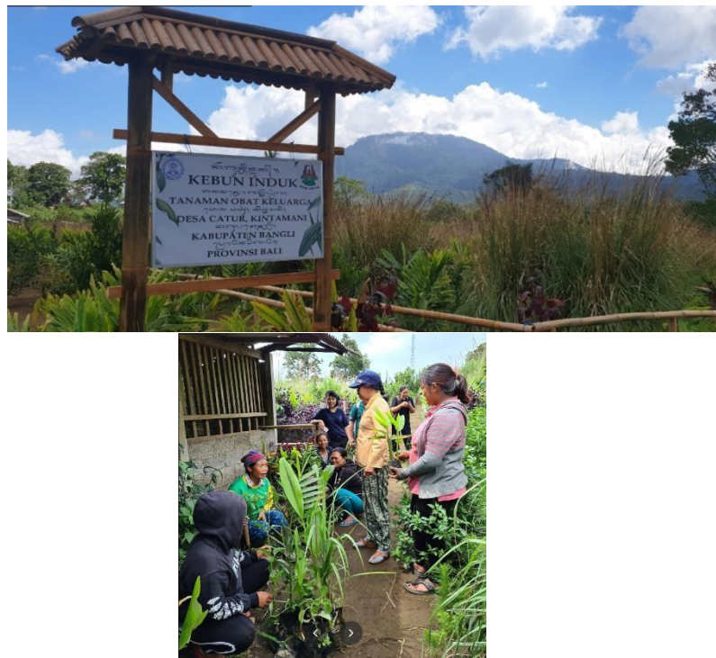
Figure 4. Demonstration Plot (Main Herbal Garden of Undhira in Catur village)

One of the initial plan to educate the villagers about composting was scrapped because the community group has already produced organic fertilizer from the by-products of coffee fermentation (microorganism from coffee slime). However, this product had not been used in a wide scale. Undhira's team was the first to try using this product in the demonstration plot, which proved to be successful (Figure 4). From 2020 onwards, Undhira's demonstration plot has been able to produce seedlings on a regular basis, and as such plant distribution no longer needed to be done in cycles. Rather, the community groups could go directly to the main plot and collect any seedlings they may need.