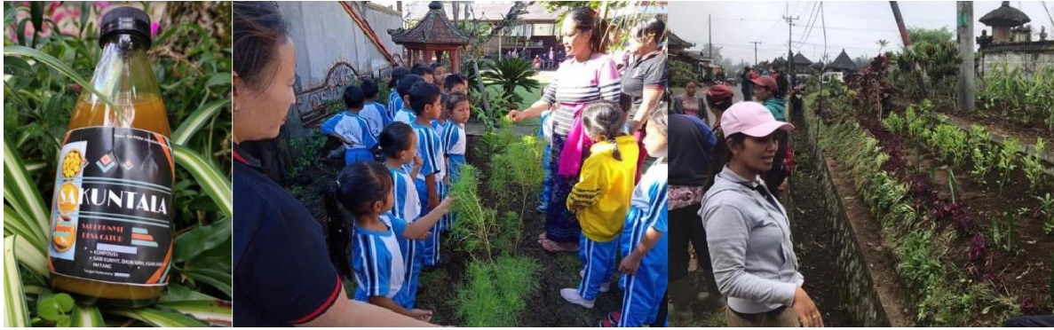
Figure 5. Spin-off Products and Local Women's Effort in Herbal Awareness