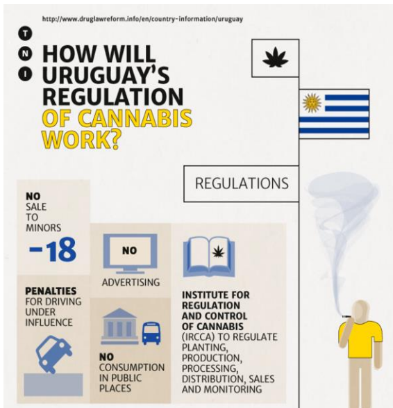
Pict.1 The system of Uruguay cannabis regulations (Transnational Institute)

In 2013, the proposal of government legalising and controlling cannabis or regulation bill about cannabis was approved and had been signed into the law no. 19172. The cannabis policy reform is called Estrategia por la vida y la convivencia or Marijuana and its derivatives that include the regulation of cannabis use and market in Uruguay (Moreno, R. P., n.d.).