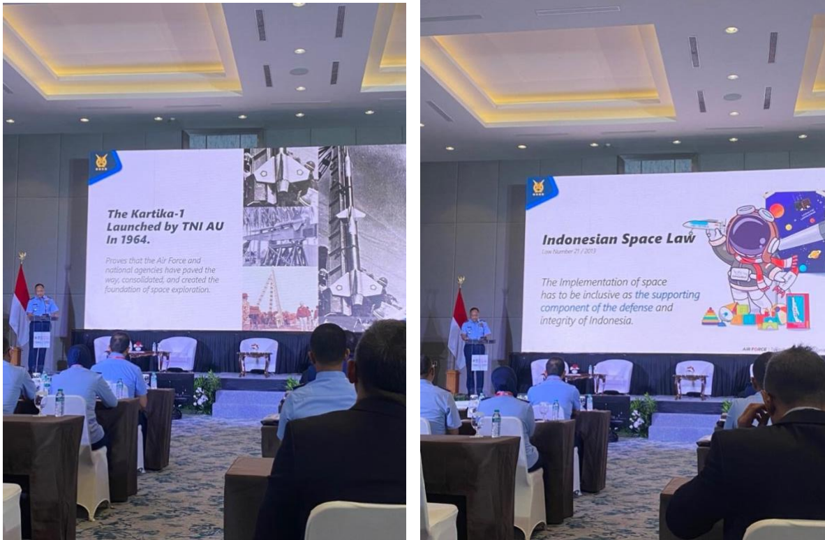
Figure 2. Presentation moment in Indo Defence: Space Summit (Francoise, 2022)

politics, New Order giving us so much problems in social, political, and economic life, so that defense, especially military was only used as tool of politic, not the legitimate institution to implement civilian rights. Even during New Order time, trust on military officials were decreasing dramatically, in respect to the period of Indonesian defense heritage, while we knew that first military soldiers, together with civilians, were well cooperating to end Dutch military aggression, that had happened after independence.