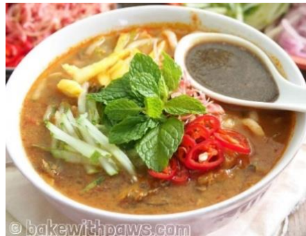
Figure 1 Asam Laksa (Bake with Paws, 2017)

Supported by the research of Youri Oh (2019), laksa , the well-known dish of Peranakan cuisine, is the dominant food that can be distinguished by its taste, given the geographical proximity of each bordering country. Penang laksa, also known as Asam Laksa (Figure 1), uses mainly chili, herbs, shrimp paste, lime, galangal and tamarind which produce a sour and tangy flavor, shows clear evident that it bears a Thai influence. Meanwhile, Malaccan laksa, also known as curry laksa, is a curry-like noodle soup cooked with authentic Malaysian herbs such as curry leaves, cumin, chicken and/or prawns, fish balls, fried tofu, belachan, chili, and added with Indonesian influence, which comes in the form of coconut milk that gives sweeter flavor.